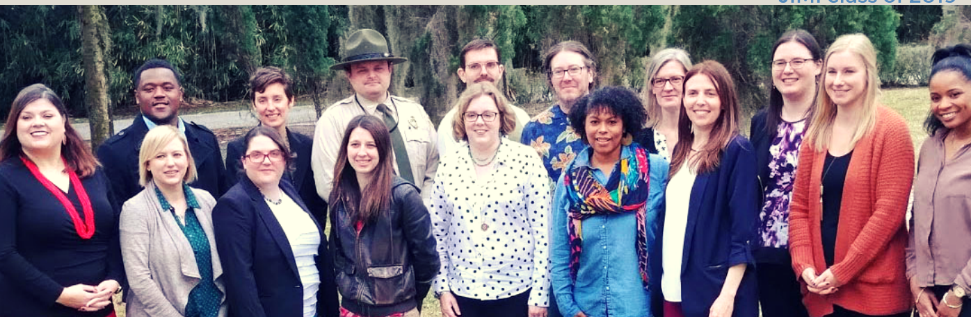
JIMI class of 2019

JIMI offers opportunities for participants to learn management skills through presentations, small group discussions, projects and participatory exercises. Participants discover their management styles through self-tests and activities, group project assignments and presentations.